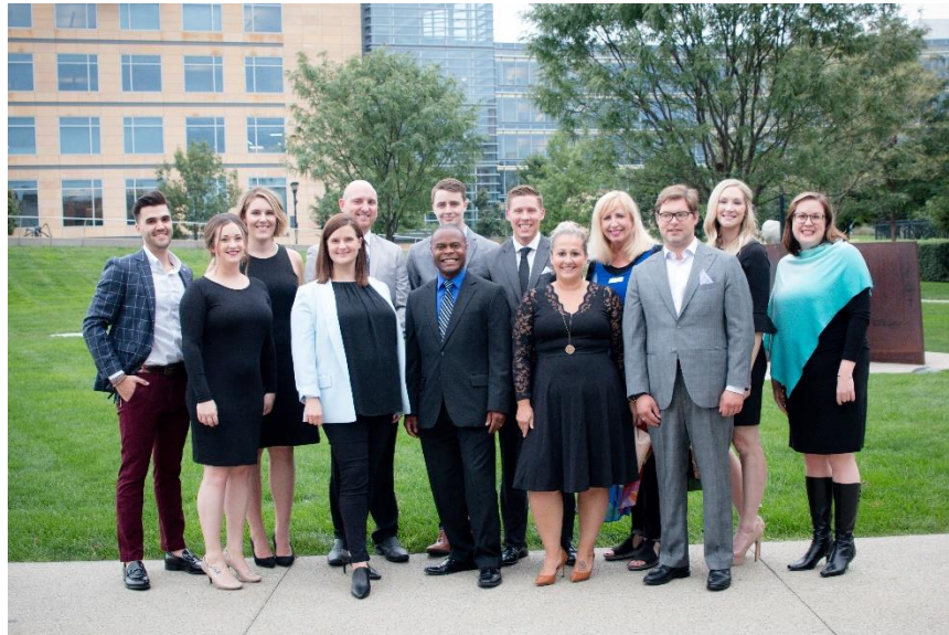
2018 CLASS OF NEW LEADERS OF DES MOINES TOGETHER RAISED OVER $21,000!

We invite you to be a part of this year's event and join us in celebrating these future leaders by supporting the Cystic Fibrosis Foundation and the New Leaders of Des Moines program as an event sponsor.