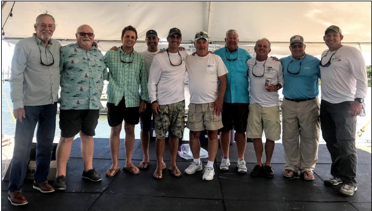
2018 Event Committee

THE OLDEST CITY RED • TROUT CLASSIC CYSTIC FIBROSIS FOUNDATION