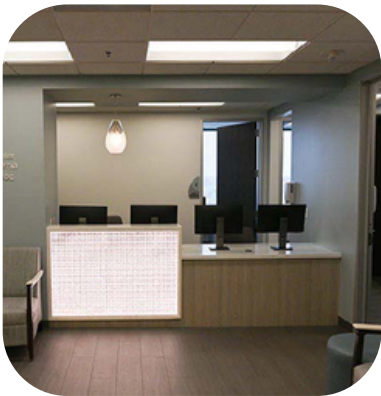
FETAL CARE CENTER*