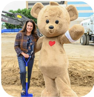
NEW SOUTHWEST TOWER*